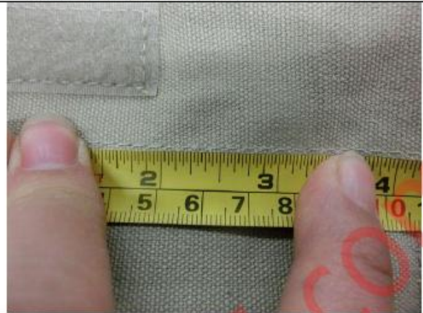
Abused test for velcro