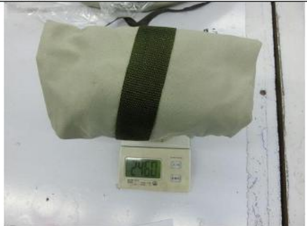
Product net weght