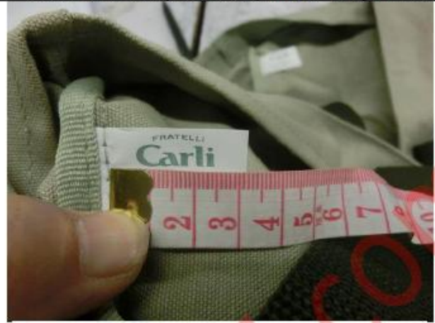
Inside PVC label: 40 x 20 mm