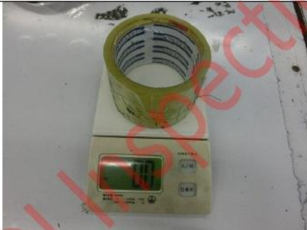
Product net weght