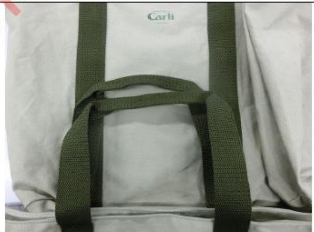
3M Tape check