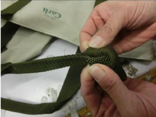
Pull test for handle