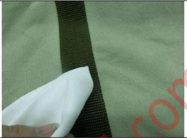
Metal detect check