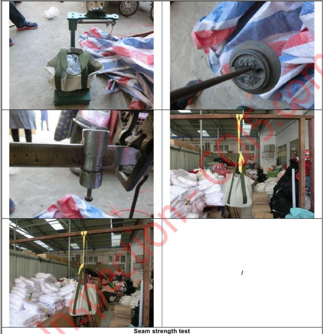
Seam strength test