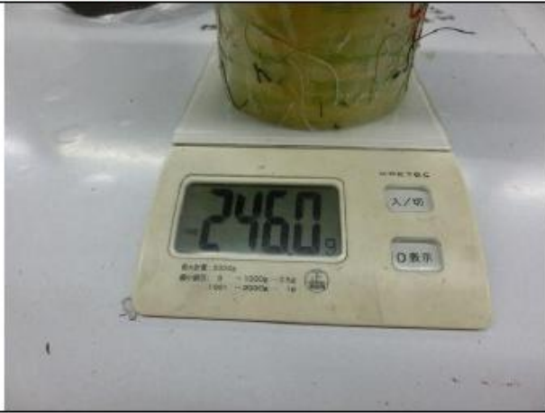
Product net weight