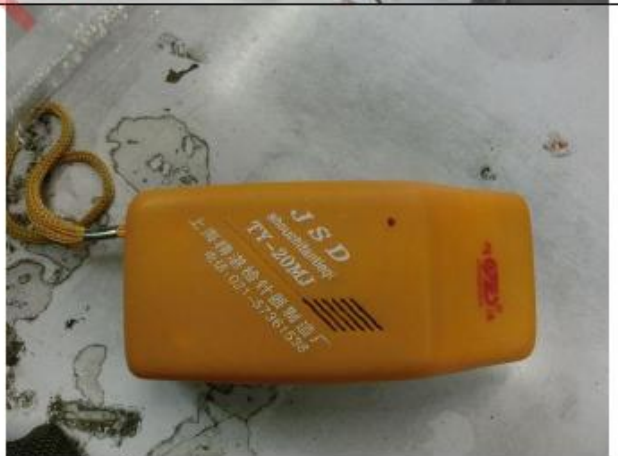
Stitch test, 8 Stitches/inch