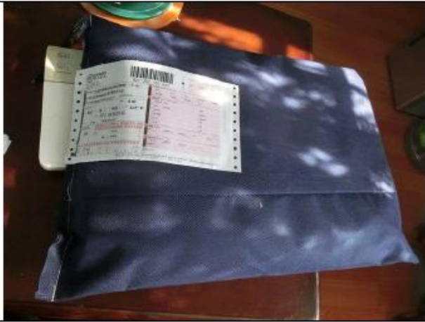
Send to office