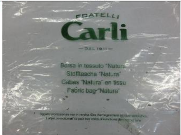
Printing of poly bag