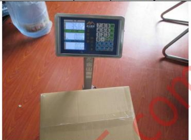
Remarks #3.: actual scale G.W was 3.582Kg instead of 4.3Kg as shipping mark