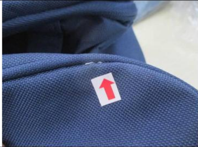
Color thread on surface-Minor