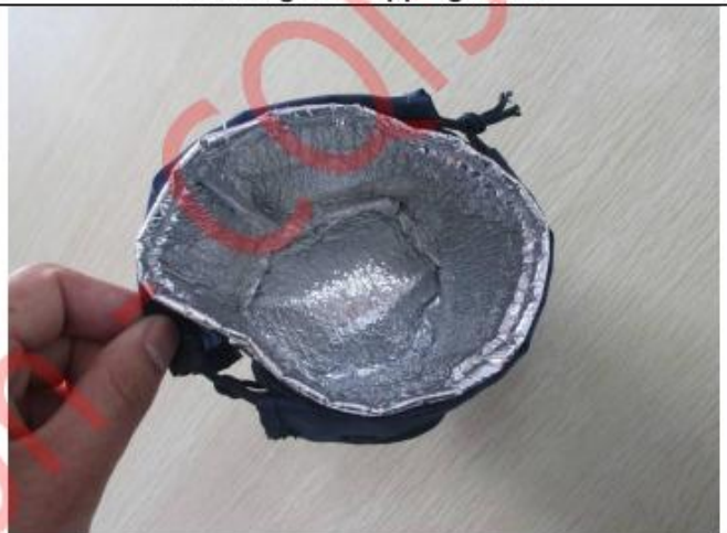
Remarks #5.: The supplier told us the cylindric bag was made by heat insulation material which could last 3-4 hours. But it could not be tested on site.