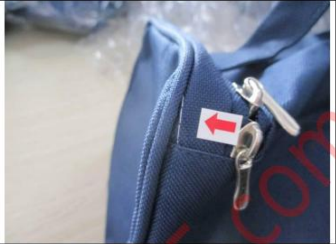
Color thread on surface-Minor