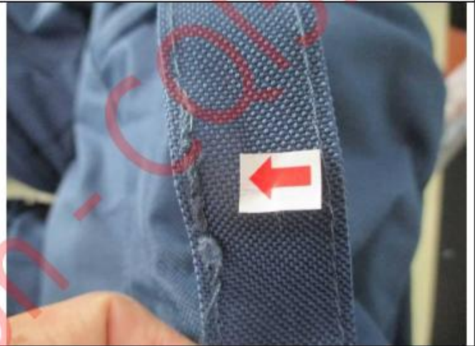
Messy stitches -Minor