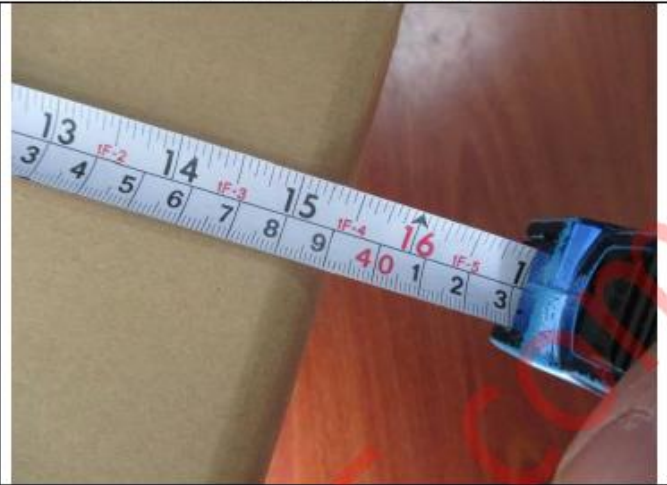
Cartons dimension check