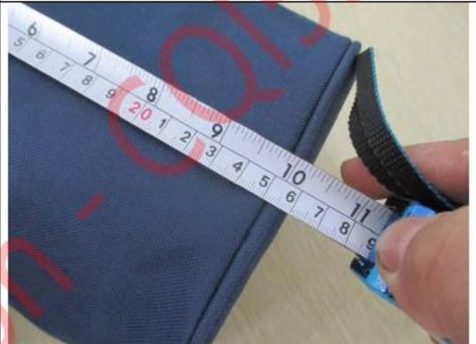
Product dimension check