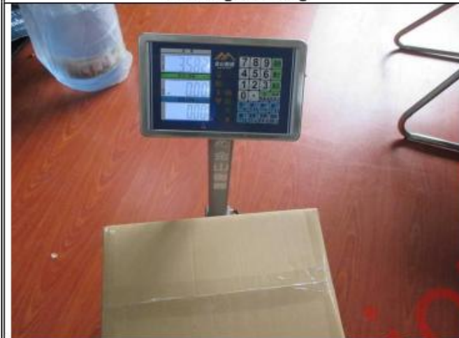
Carton weight check