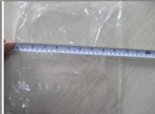
Remarks #2.: there is no warning text on poly bag which opening is beyond 18cm