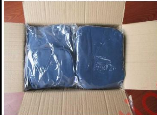
Remarks #4.: There is no anti-cutting board on top/bottom carton.