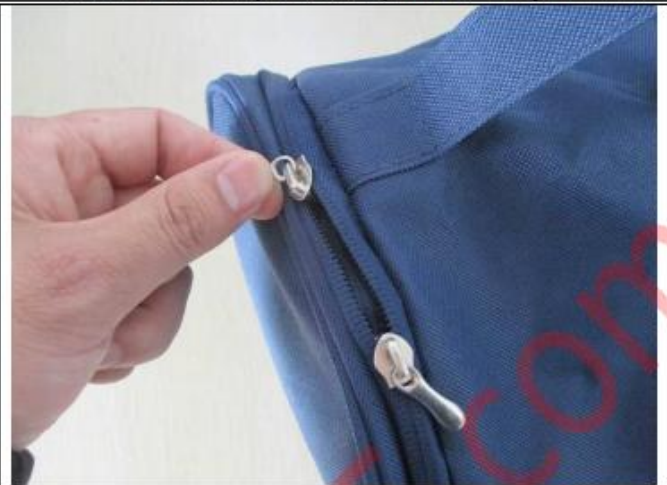
Zipper function test