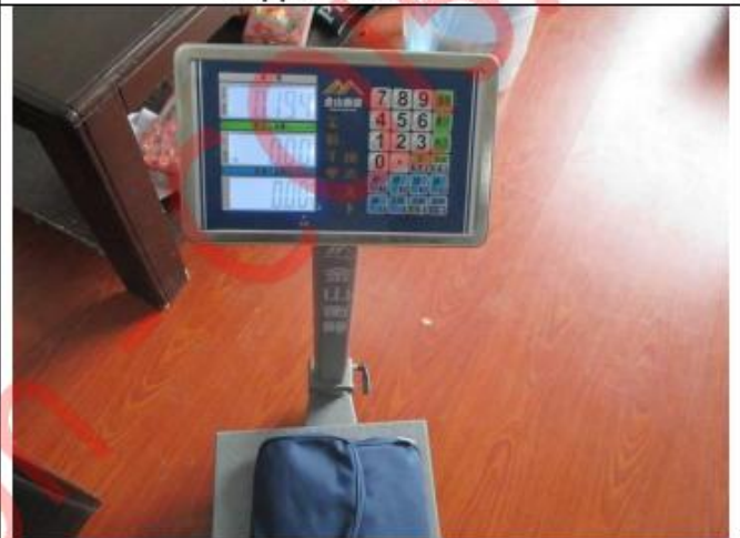
Product net weight check