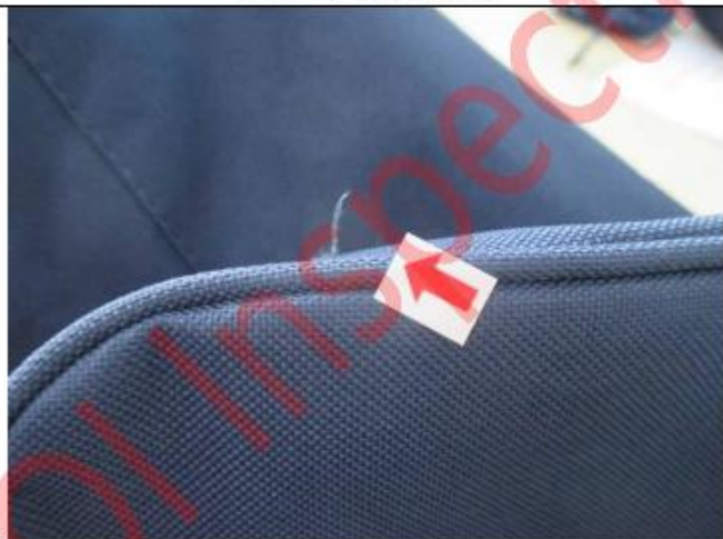
Untrimmed thread ends-Minor