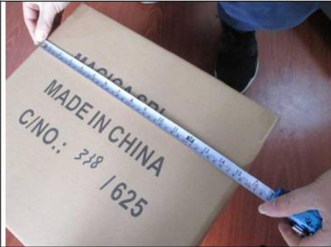
Cartons dimension check