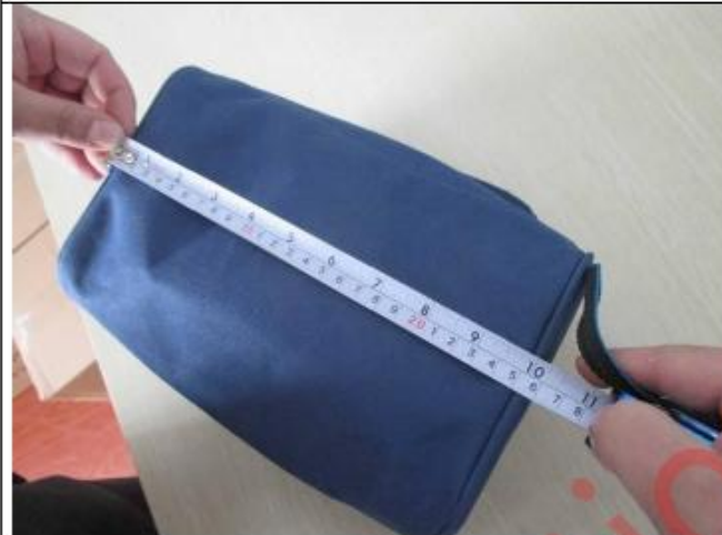
Product dimension check