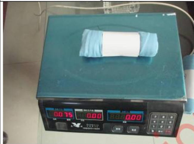
Product weight check 3