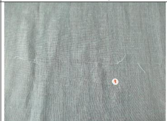
Fabric defects – major 4