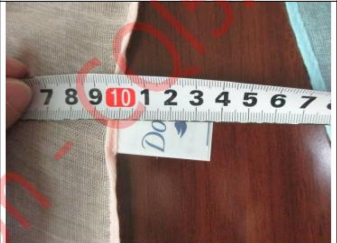
Label size measuring : 2.5X 3.6cm