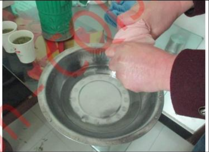
Color fastness test 4