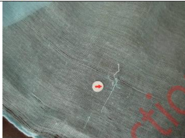
Fabric defects – major 1