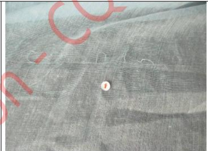
Fabric defects – major 2