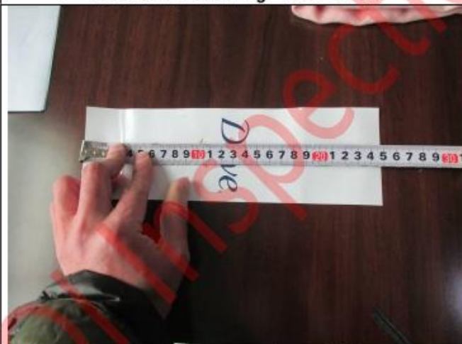
Logo card size measuring : 25X8cm