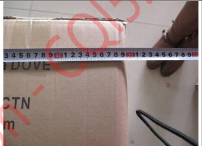
Carton size measuring 2