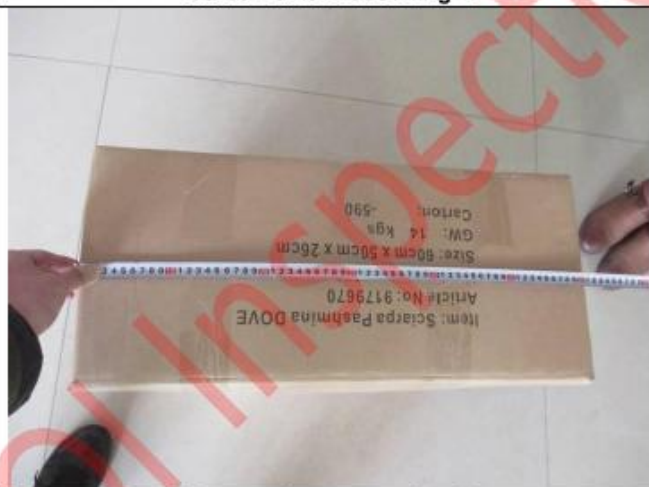
Carton size measuring 3