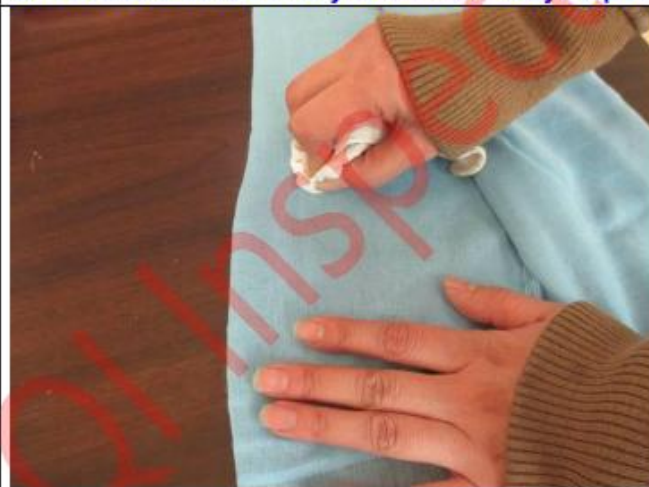
Rub test 1