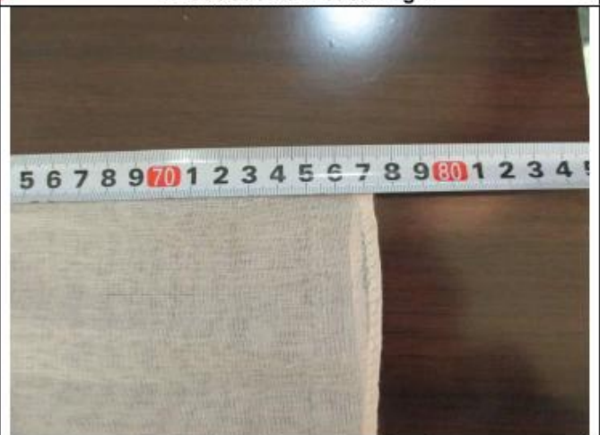
Product size measuring 6