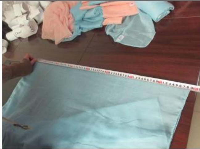
Product size measuring 1