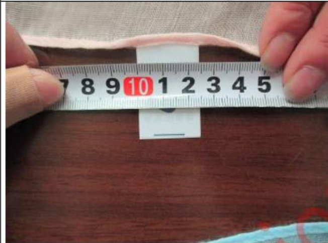
Label size measuring : 2.5X 3.6cm