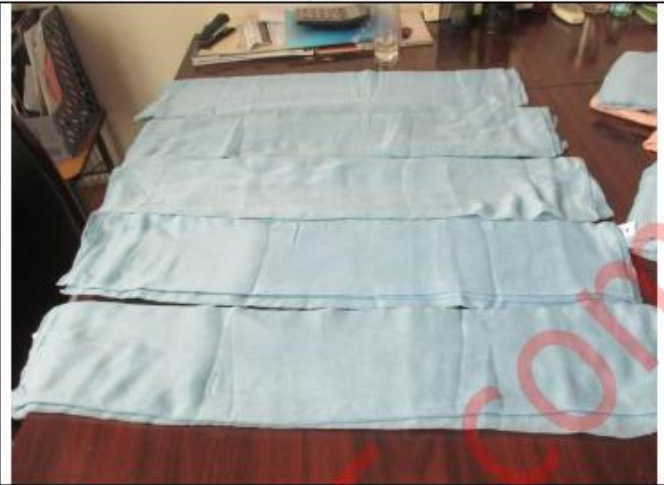
Color shading check 2