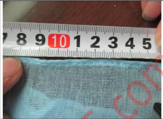
Count number of stitches per 3cm 2