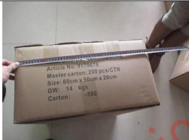
Carton size measuring 1