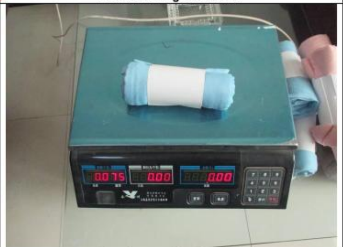
Product weight check 6

Notice: This report is issued by the company under its General Conditions for inspection, assessment, technical assistance. The issuance of this report does not exonerate buyers or sellers from exercising all their rights and discharging all their liabilities under the contract of sales. Stipulations to the contrary are not binding on the company. The company's responsibility under this report is limited to proven negligence and will in no case be more than eight times the amount of the fees or commission, which will be paid by free Man-day.