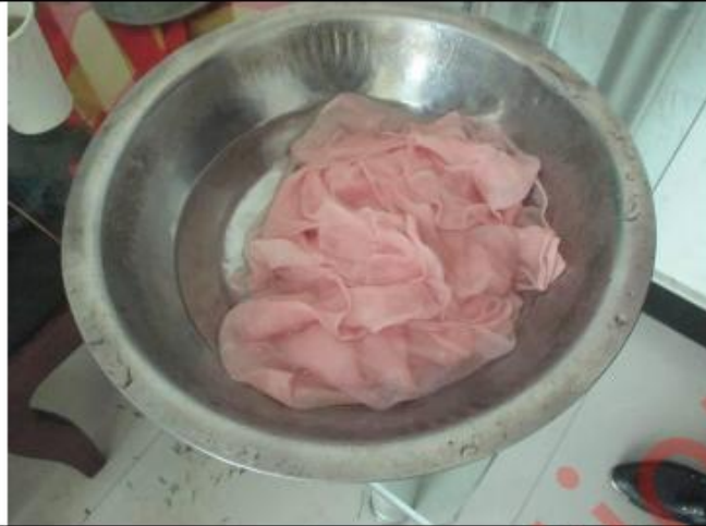
Color fastness test 3