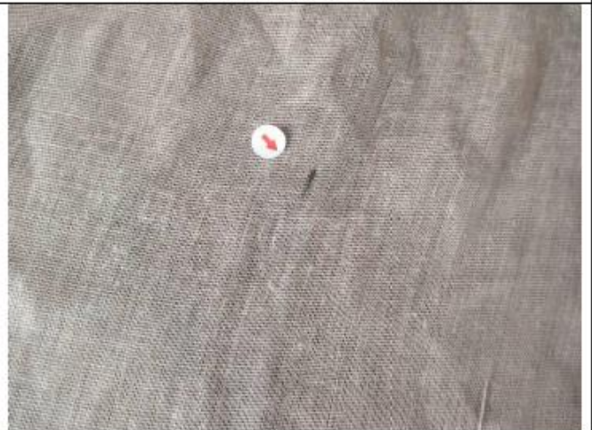
Stain mark (factory removed them at once) – minor 2