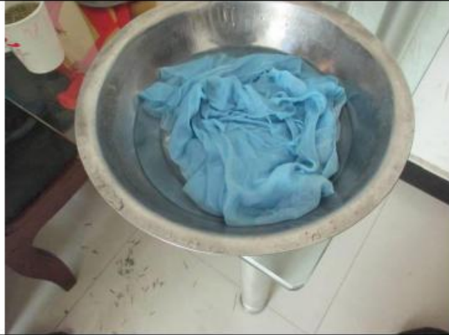
Color fastness test 1