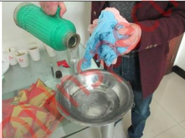
Color fastness test 5