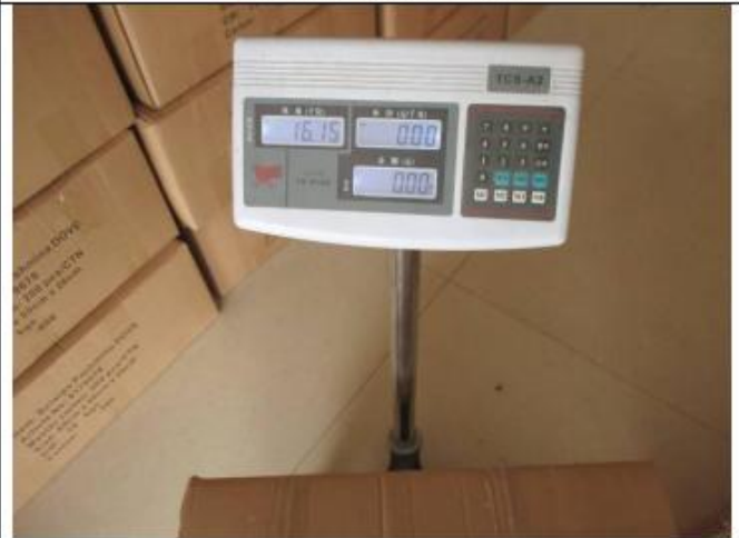
Carton weight check 2

Notice: This report is issued by the company under its General Conditions for inspection, assessment, technical assistance. The issuance of this report does not exonerate buyers or sellers from exercising all their rights and discharging all their liabilities under the contract of sales. Stipulations to the contrary are not binding on the company. The company's responsibility under this report is limited to proven negligence and will in no case be more than eight times the amount of the fees or commission, which will be paid by free Man-day.