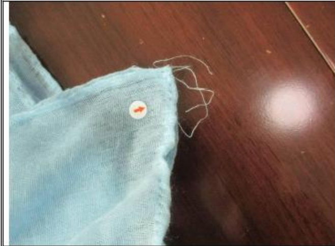
Untrimmed thread end – minor 2