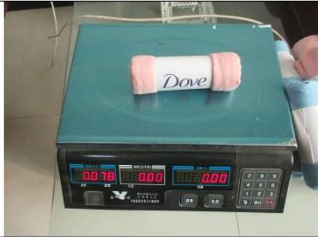
Product weight check 7