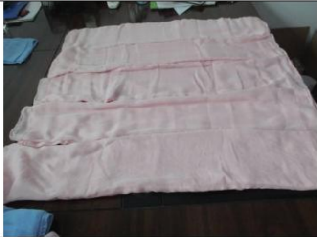
Color shading check 1