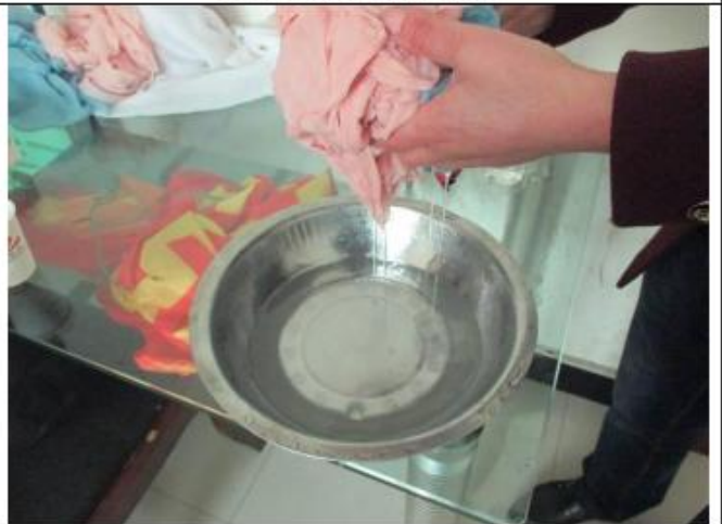
Color fastness test 6