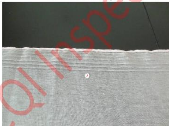
Fabric defects – major 3