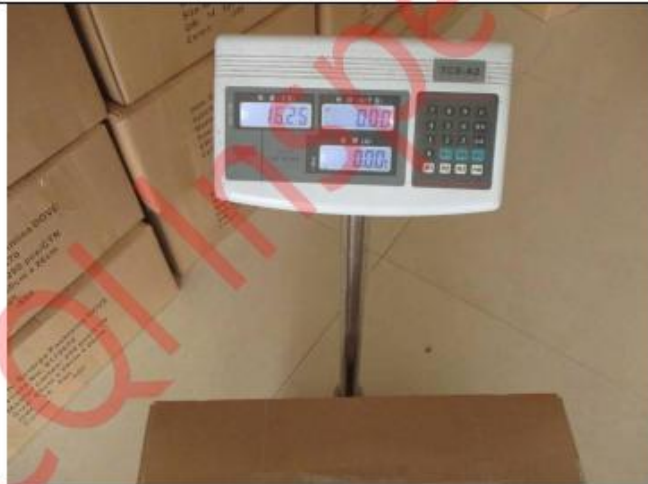
Carton weight check 1