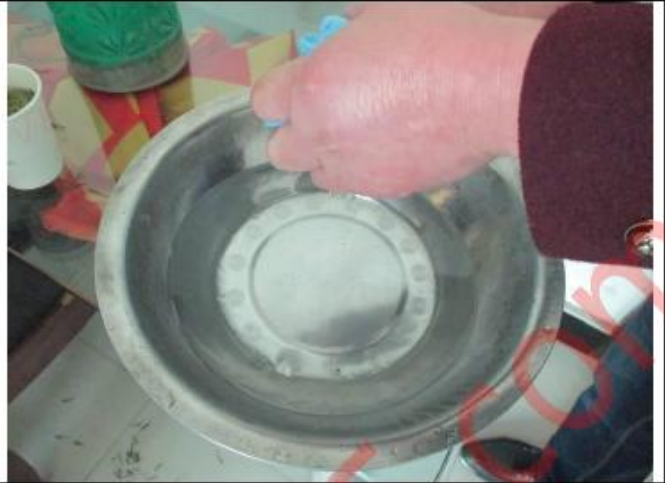
Color fastness test 2