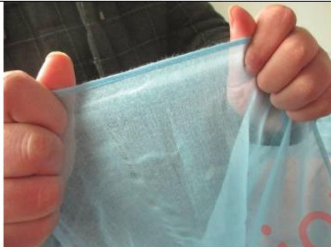
Seam strength test for woven garment 1