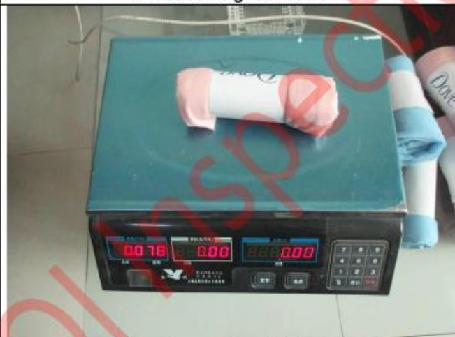
Product weight check 5