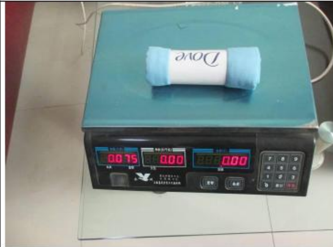
Product weight check 1