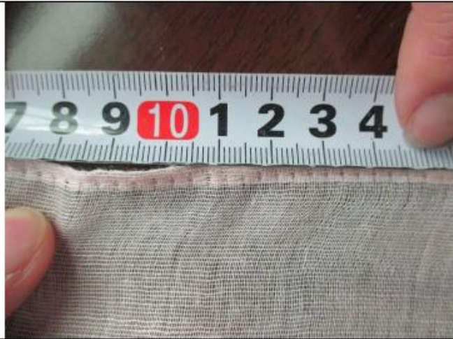
Count number of stitches per 3cm 1