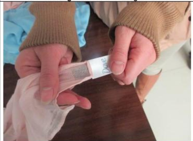
Pull test for all accessories 2