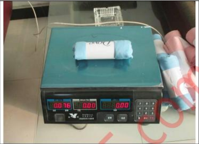
Product weight check 8