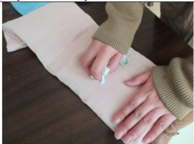
Rub test 2