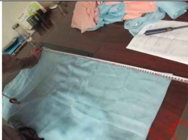
Product size measuring 3