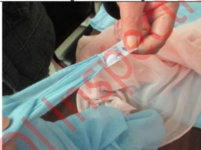
Pull test for all accessories 1