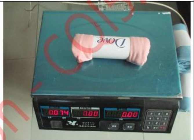
Product weight check 4