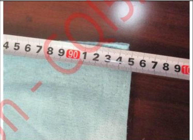
Product size measuring 4