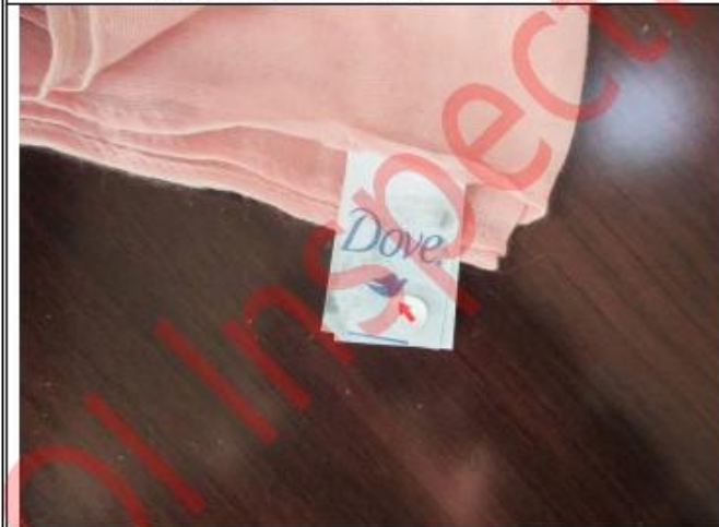
Stain mark (factory removed them at once) – minor 1