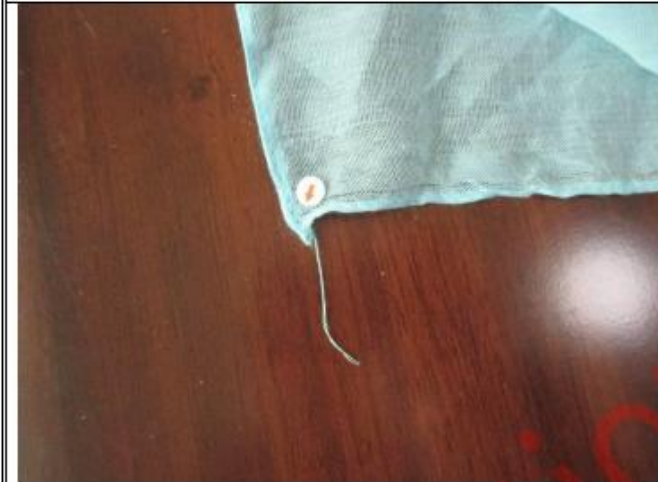
Untrimmed thread end – minor 4