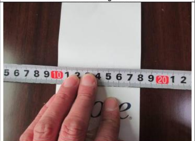
Logo card size measuring : 25X8cm