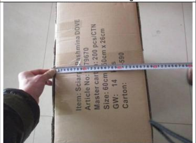
Carton size measuring 4