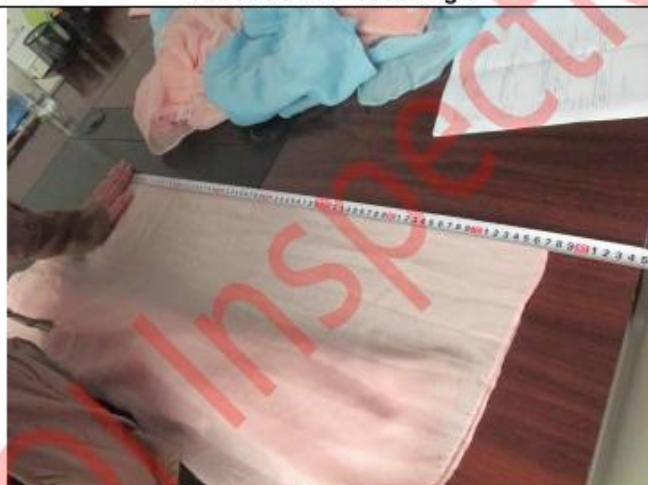
Product size measuring 5