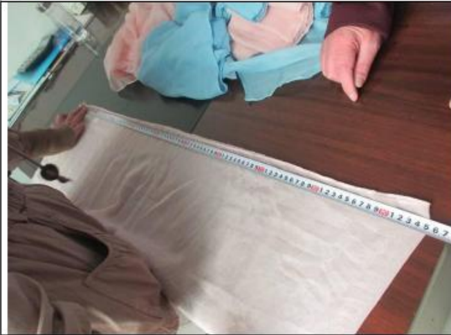
Product size measuring 7