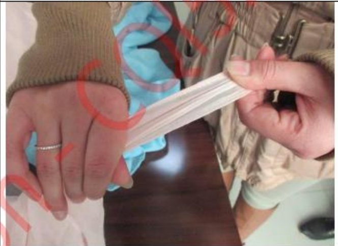
Seam strength test for woven garment 2