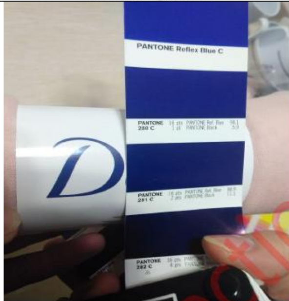
Pantone check for label