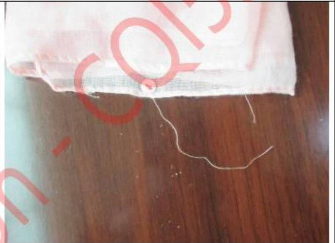
Untrimmed thread end – minor 5