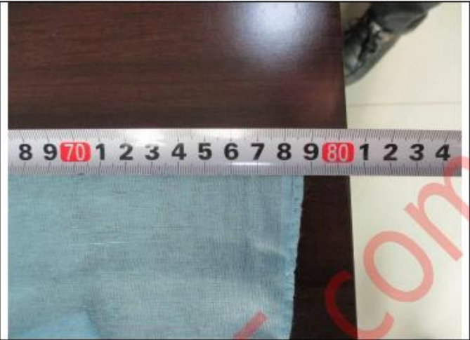
Product size measuring 2