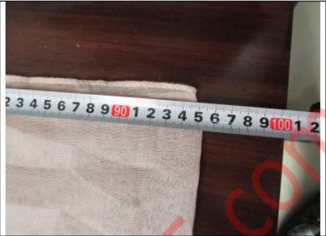
Product size measuring 8