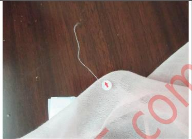
Untrimmed thread end – minor 3