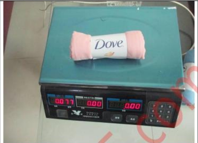
Product weight check 2