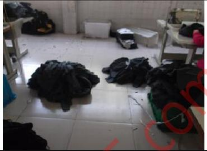
Clothing production workshop 6