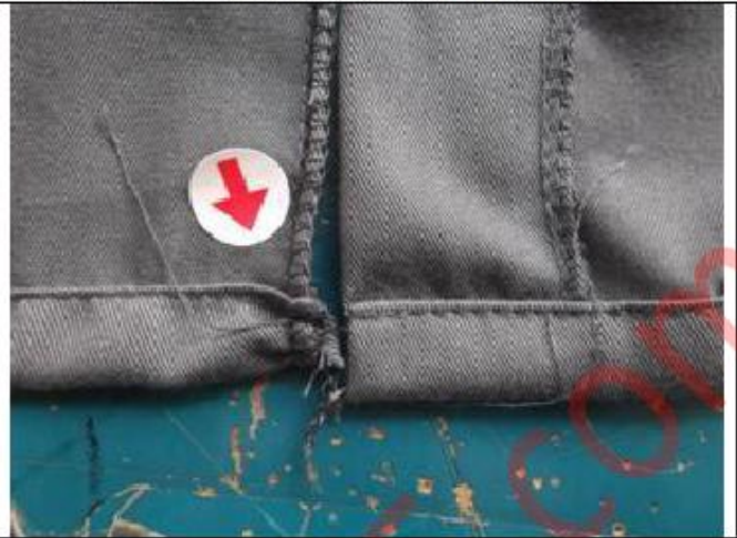
Uneven bottom width