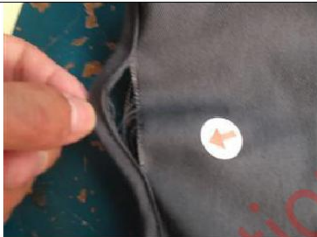
Opening seam at armhole