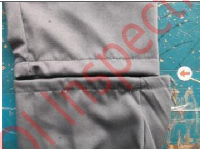
The cuff width