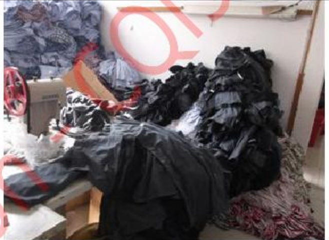
Remark #.: 4, State of the finished product warehousing