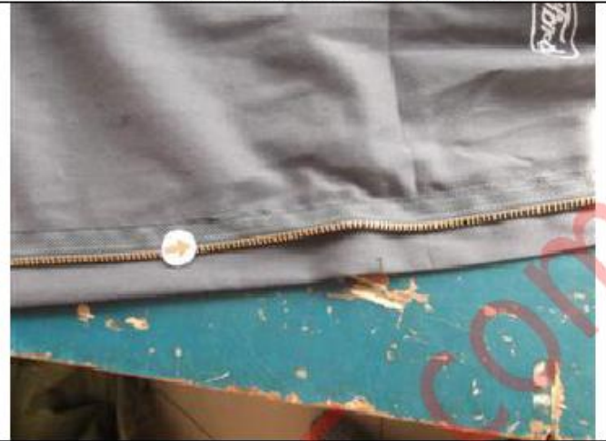
Zipper wave in side seam