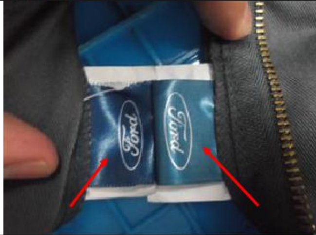
Remark #.: 2