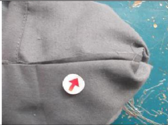
Pocket without kao grams