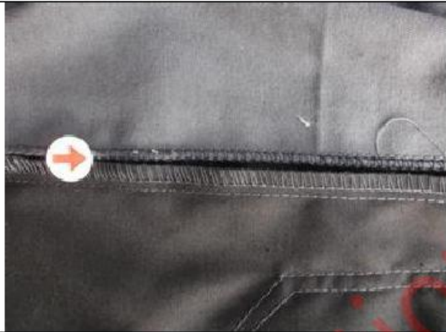
Kao edge line width