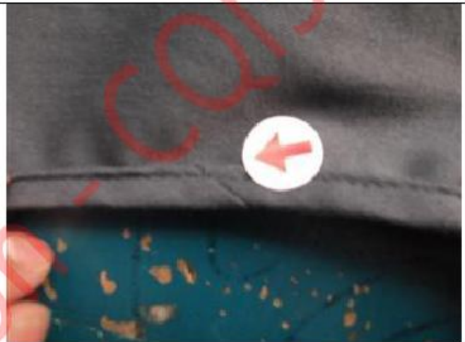
Package edge fabric has a joint