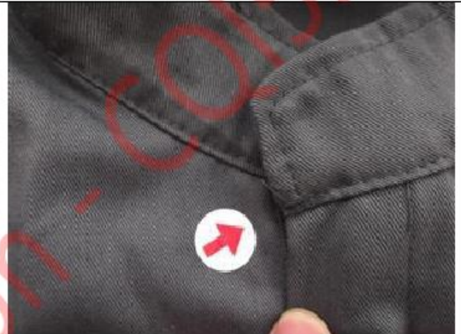
Uneven V neck shape