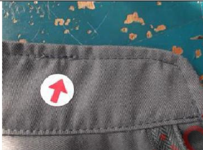
Top stitch run of