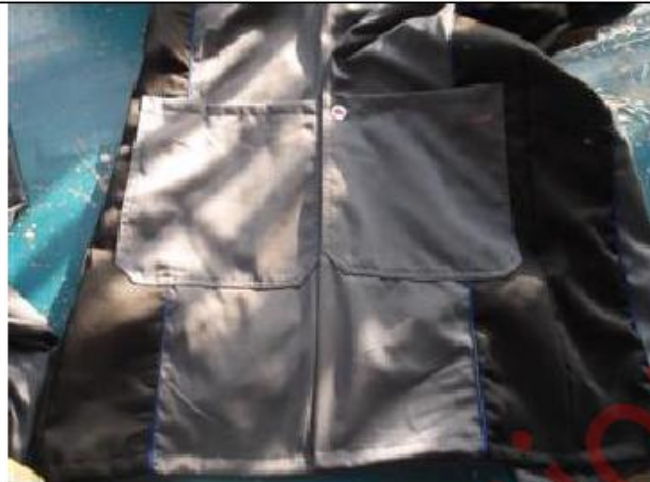
Both pocket set uneven