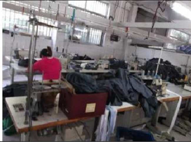
Clothing production workshop 5