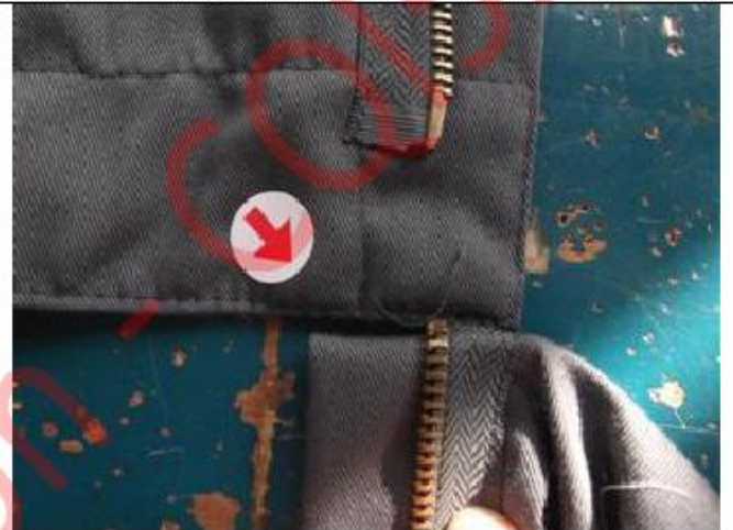
Uneven width in the plackets.