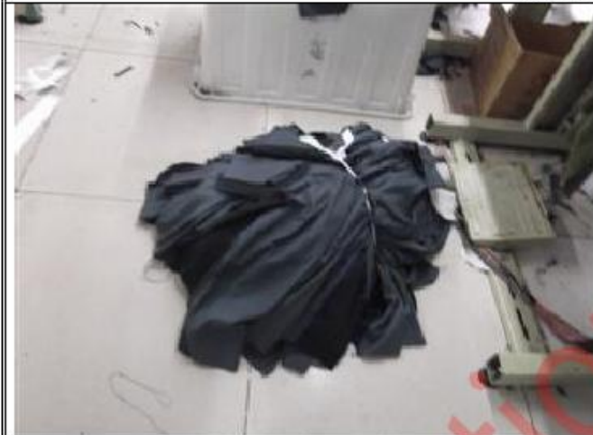
Remark #: 4, Cut the fabric 1