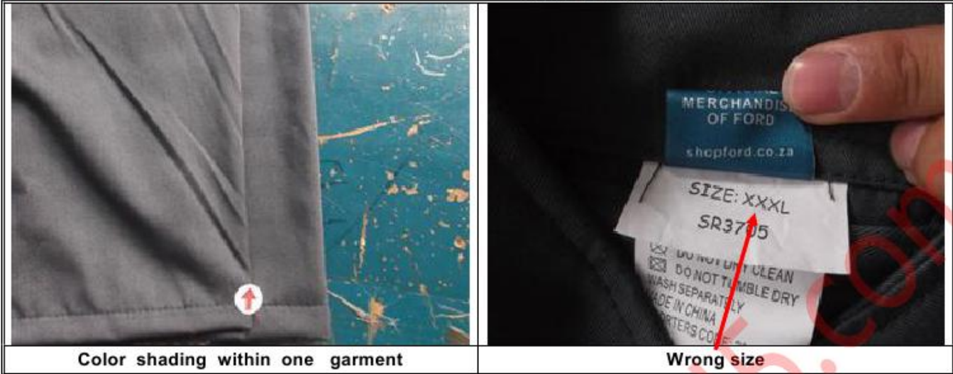
Color shading within one garment