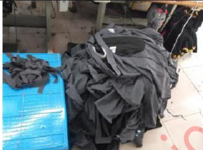
Clothing production workshop 7