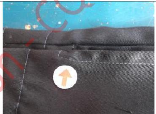
Both pocket set uneven