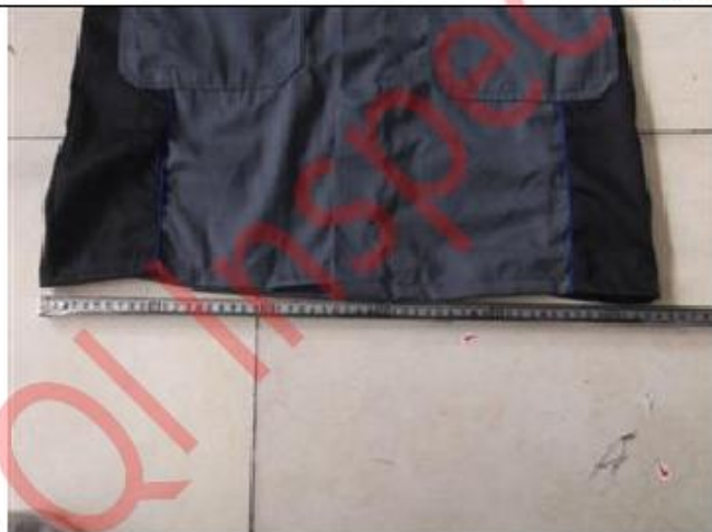
bottom hem not smooth