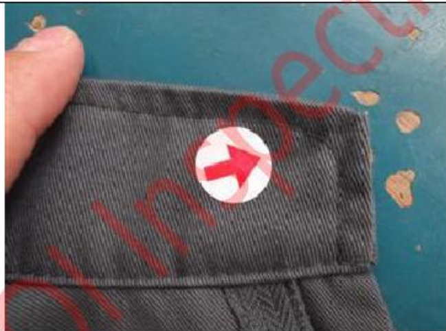
Uneren lapel shapes