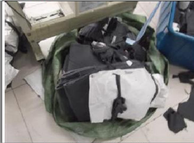
Remark #: 4, Cut the fabric 1