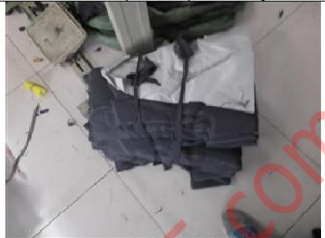
Remark #: 4, Cut the fabric 2