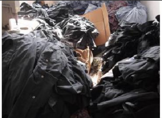
Remark #.: 4, State of the finished product warehousing