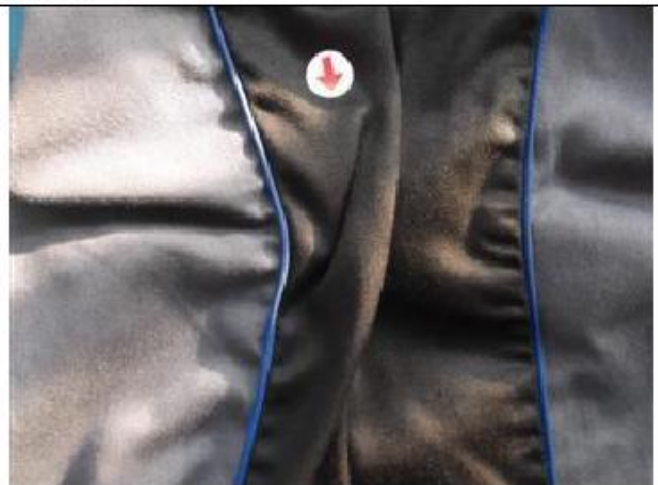
Side seam hiking