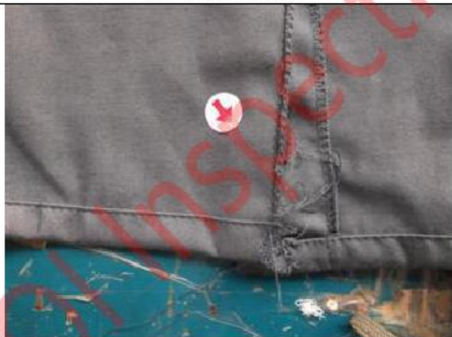
Untrimmed thread ends