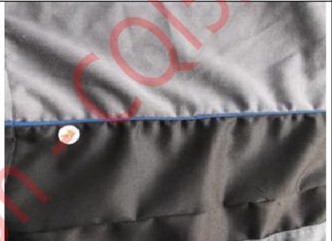
Side seam hiking