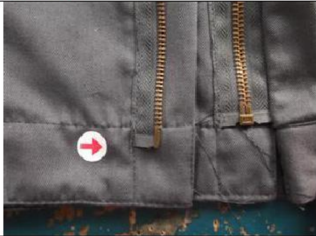
Zippers have high and low position