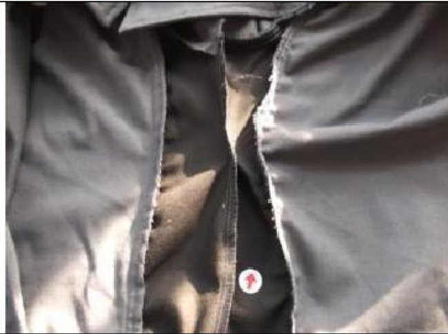
Seam opening at side seam