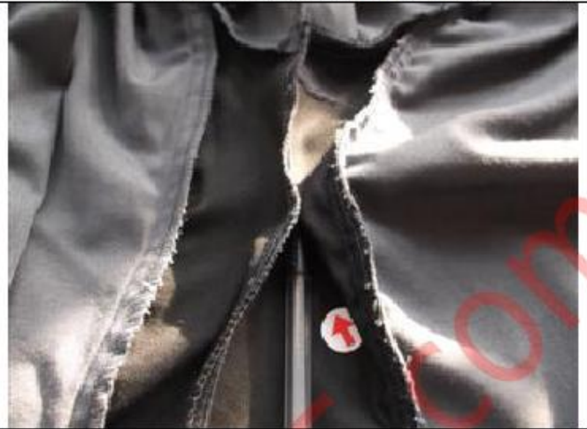
Seam opening at side seam