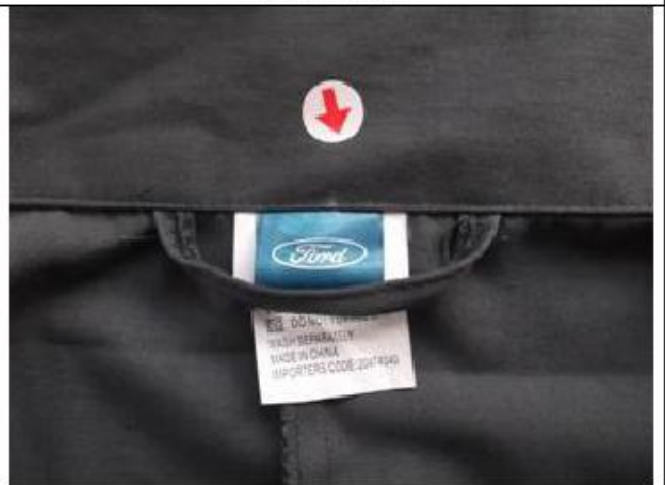
Main label crooked