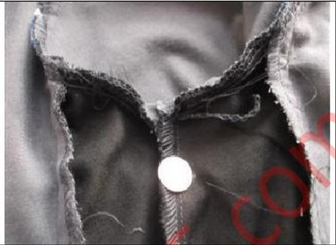
Untrimmed thread ends