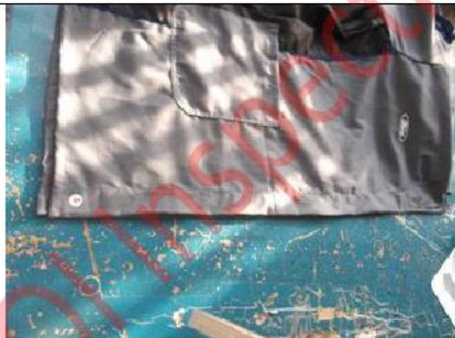
Front length uneven