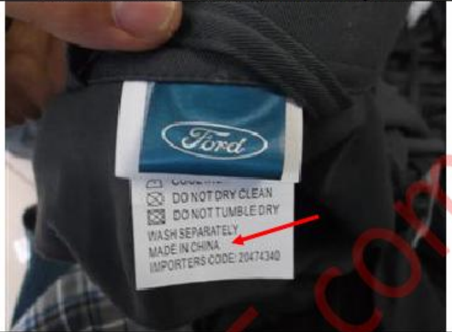
Remark #.: 3