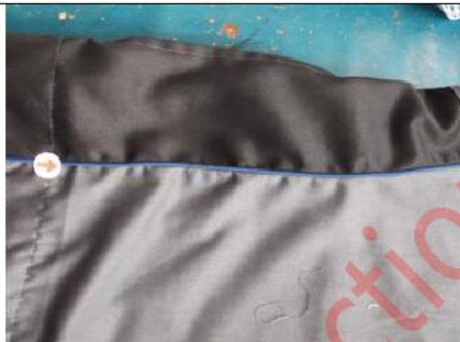
Side seam hiking