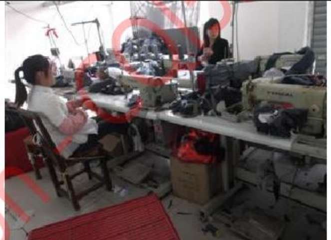
Clothing production workshop 8